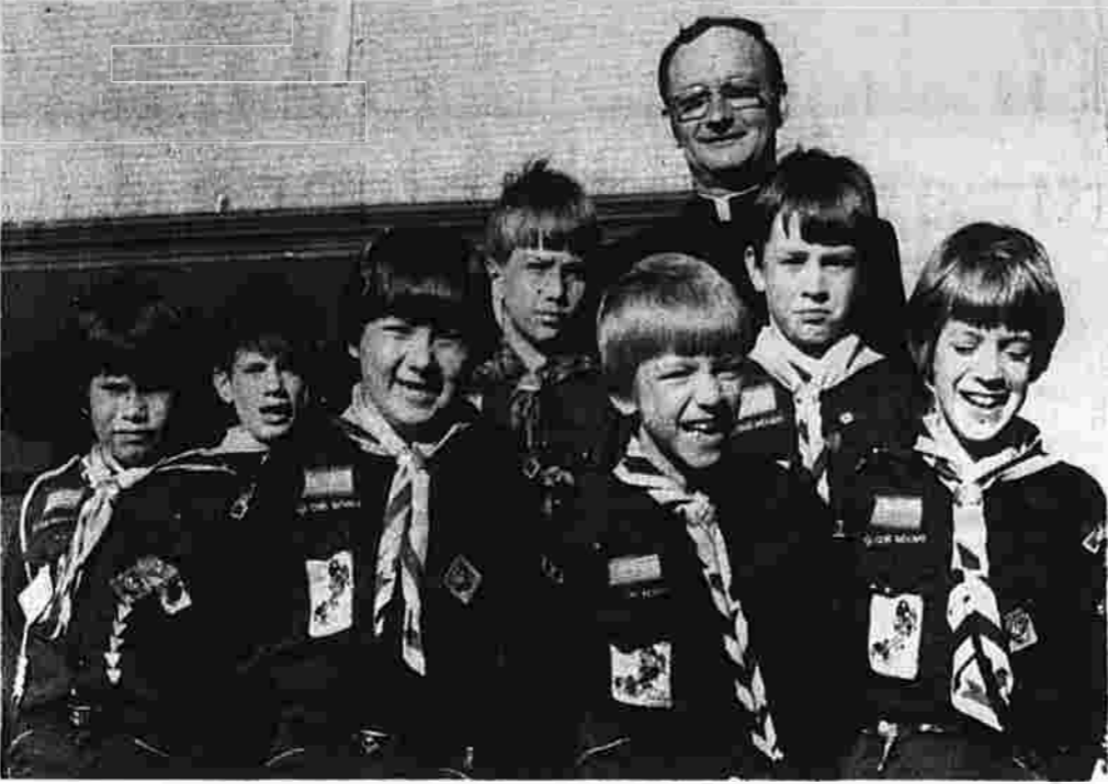
They earn Parvuli Dei award

Field trips will be conducted along the shore of Cape Cod as well as at sea aboard the R/V Veritas. The students